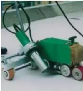
Automatic welding machine

The tools below may be used during the construction.